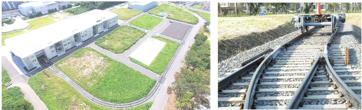
Fig. 3: Over view of Chiba Test Track 2.0 in ITS R&R Experiment Field

The research environment on advanced vehicles at Nishi-Chiba was restructured as an ITS R&R experiment field at Kashiwa campus of the University of Tokyo in April 2017. The ITS R&R Experiment Field comprised of proving ground for road, experimental traffic lights, driving simulator and Chiba Test Track 2.0 for railway with R33 curve section, turnout and railroad crossings. We plan to research and verify the vehicle using this Chiba Test Track 2.0.